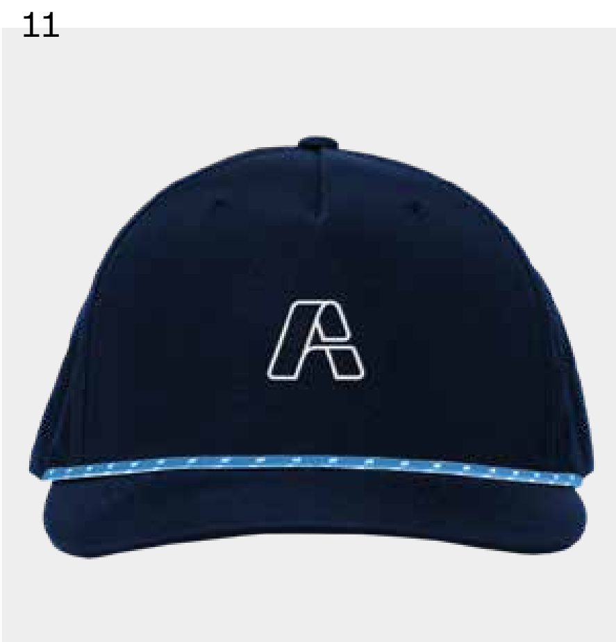
Unstructured Polyester + Perforated Poly Low Crown + Curved Brim

Performance material. Popular fabrics & fits: