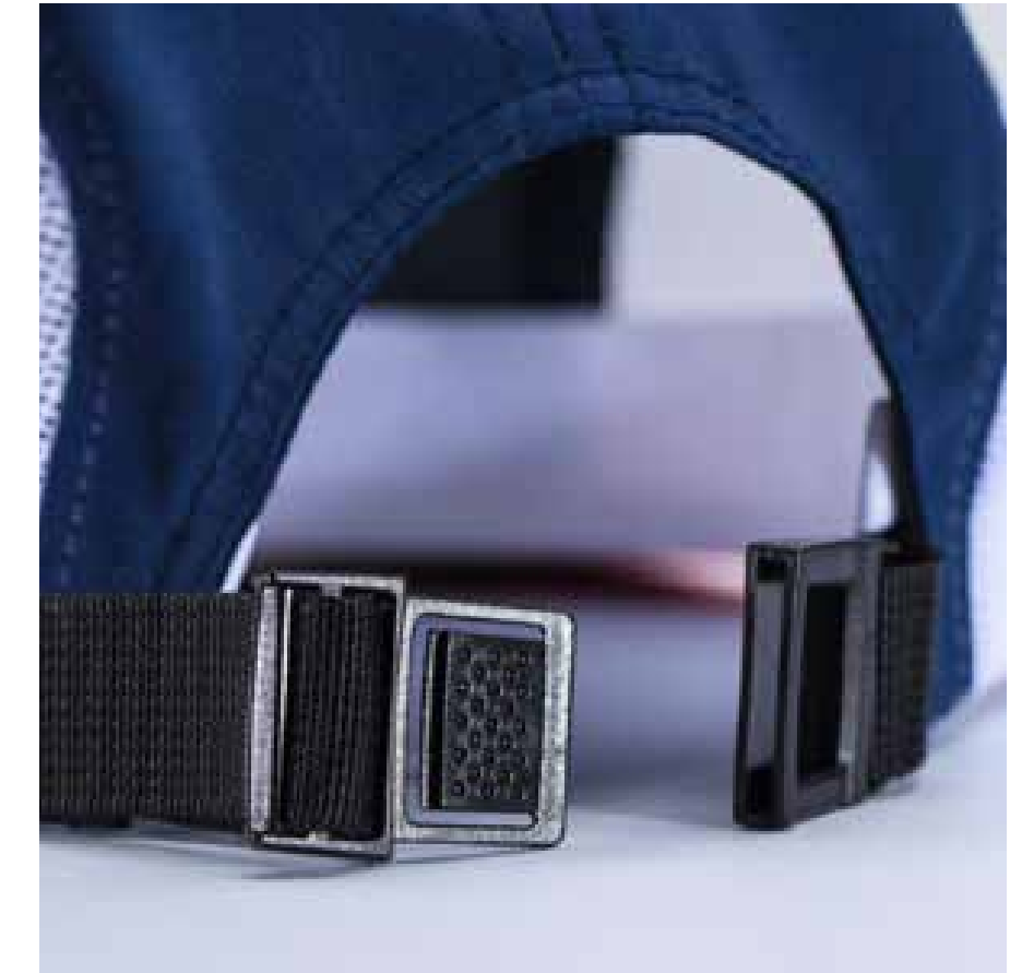
Plastic Buckle Back