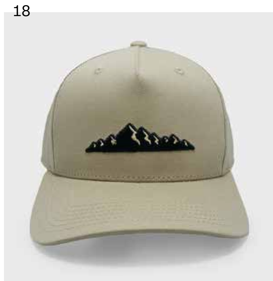
Twill Low Crown + Curved Brim