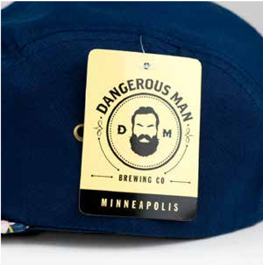
Hangtag - Standard Cardstock