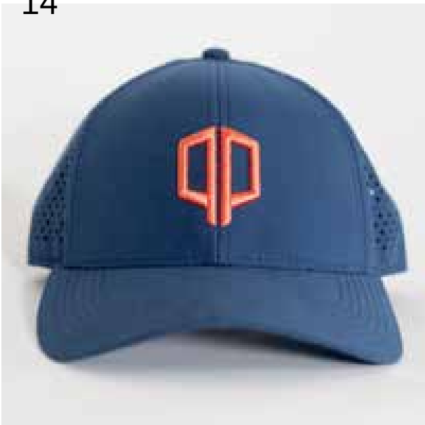
Polyester + Perforated Poly Low Crown + Curved Brim