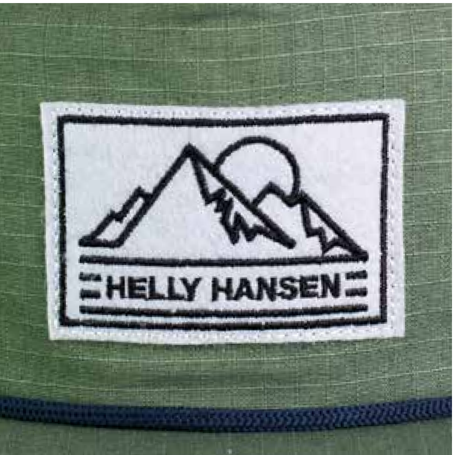
Embroidered Felt Patch