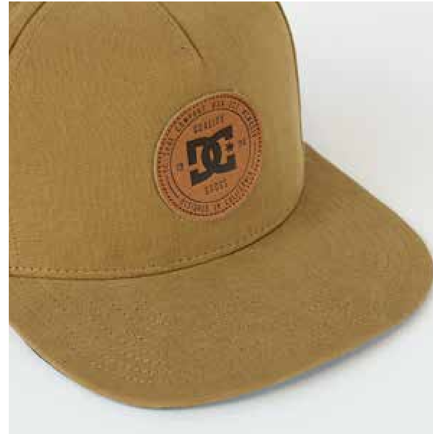
Slightly Curved Brim