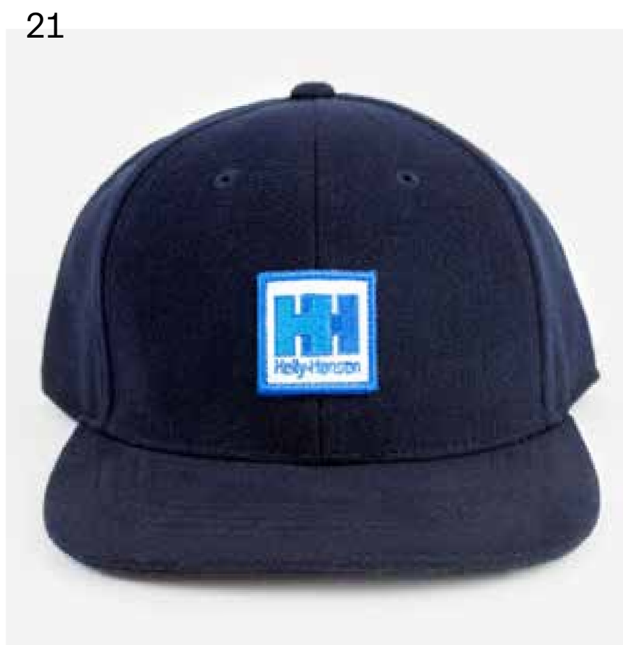
Wool Blend High Crown + Flat Brim