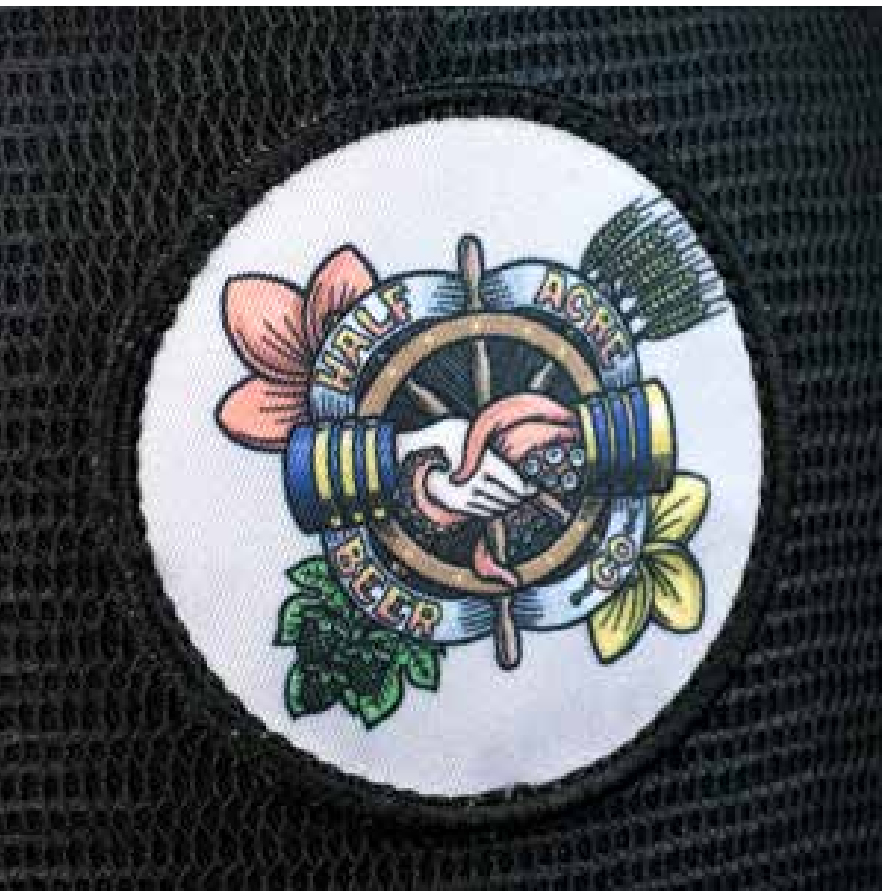
Dye Sublimated Patch w/ Merrowed Edge