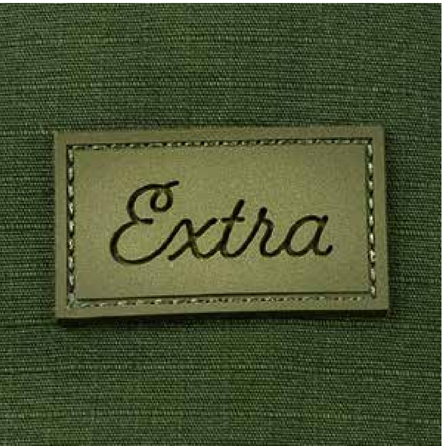
Debossed Rubber Patch