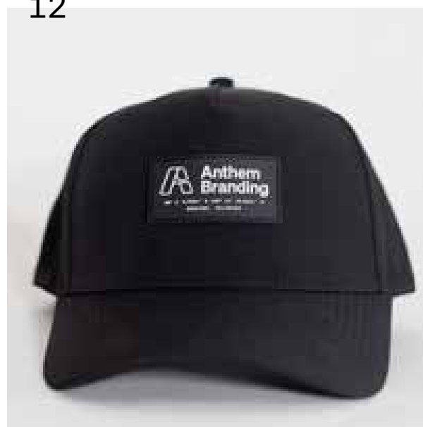
Polyester + Perforated Poly Mid Crown + Curved Brim