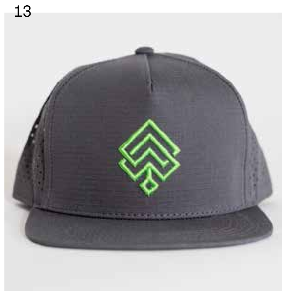
Polyester + Perforated Poly High Crown + Flat Brim

Performance material. Popular fabrics & fits: