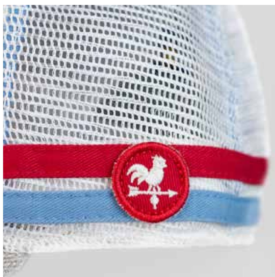
Sewn on Stripes - Mesh Adorned w/ Embroidered Round Patch