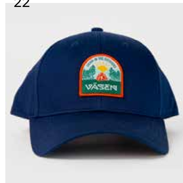
Twill Low Crown + Curved Brim