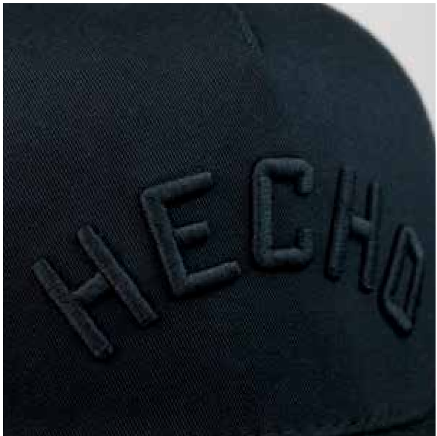
3D Puff Embroidery