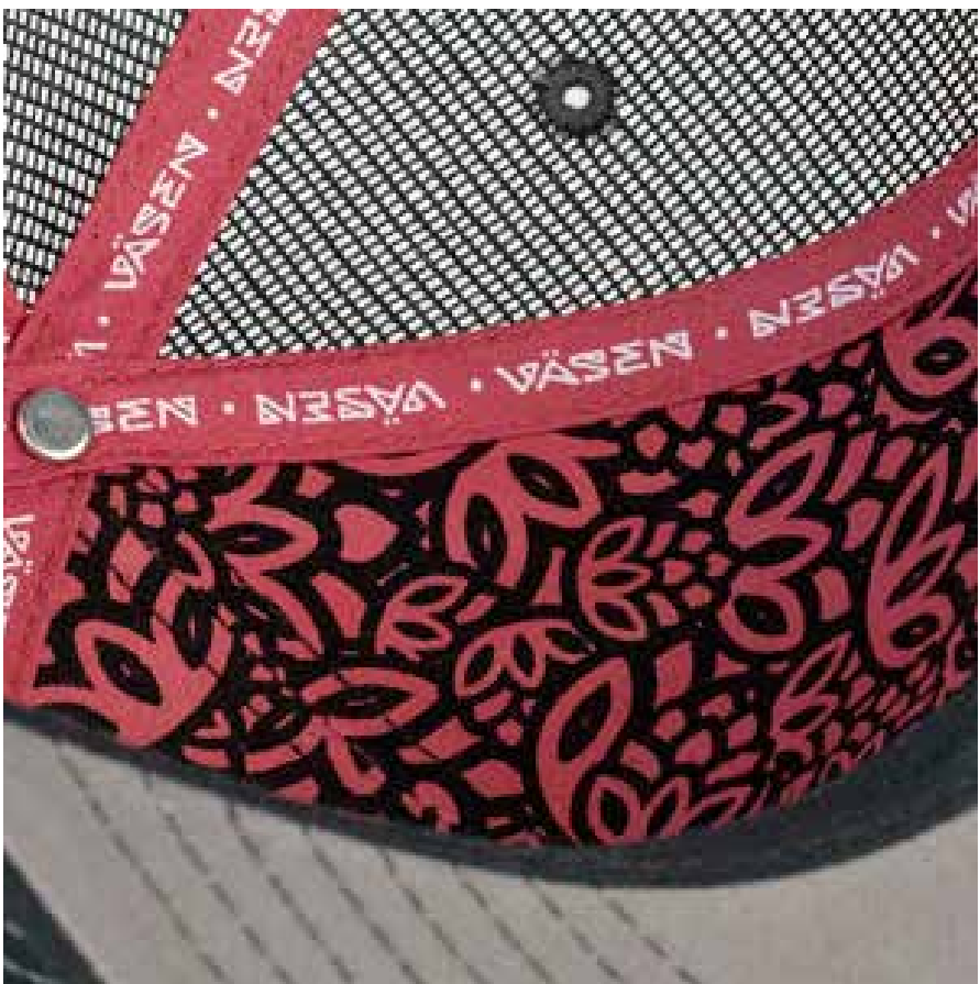
Interior Crown Screen Print