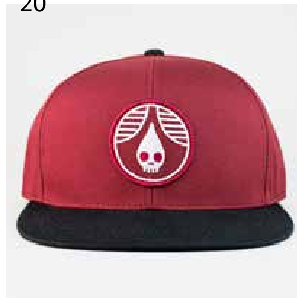
Twill High Crown + Flat Brim