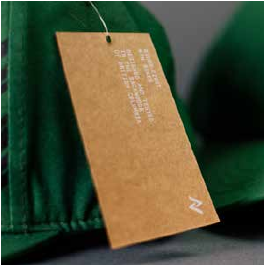
Hangtag - Craft Paper