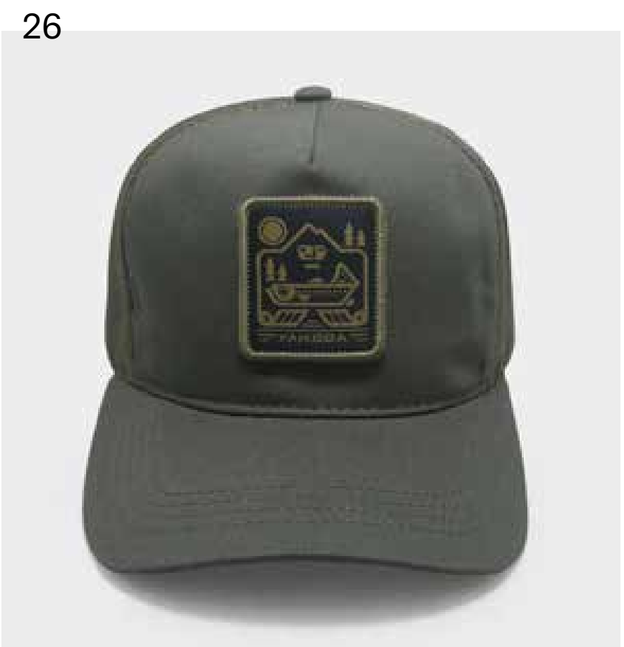
Unstructured Twill + Mesh Mid Crown + Curved Brim