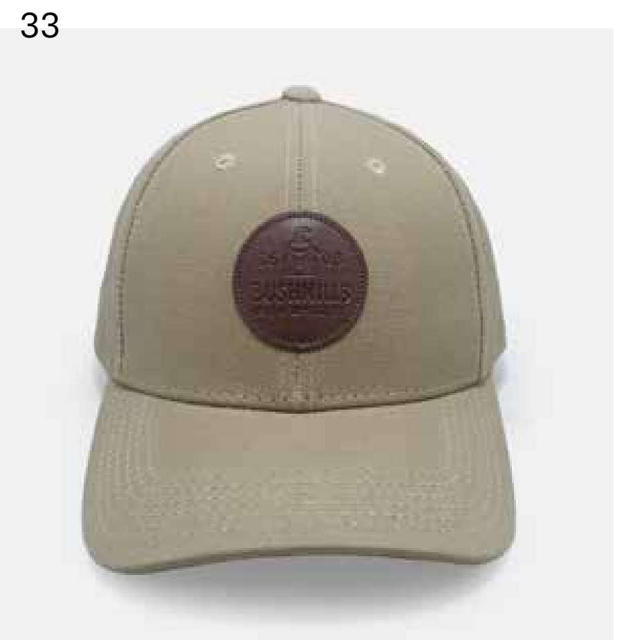
Waxed Canvas Low Crown + Curved Brim

Unique 7-panels and flat brim. Popular fabrics: