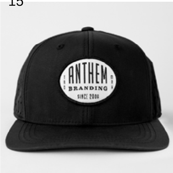
Polyester + Perforated Poly Mid Crown + Flat Brim