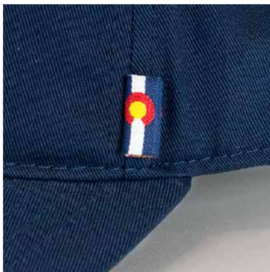
In-Seam Woven Clamp Tag