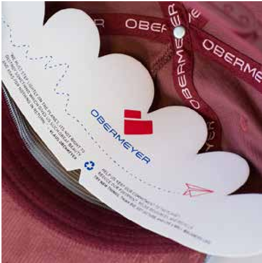
Interior Crown Insert