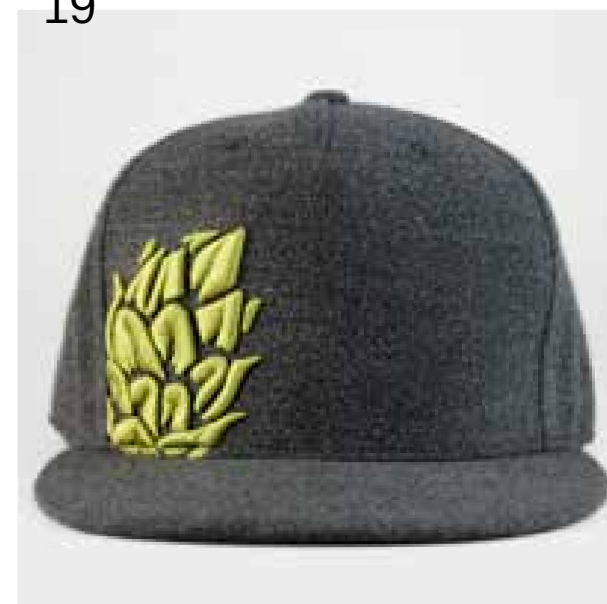
Wool Blend High Crown + Flat Brim