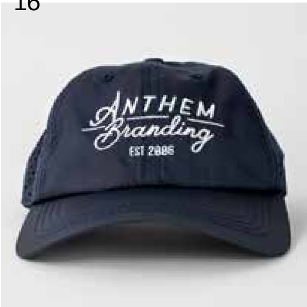
Polyester + Perforated Poly Low Crown + Curved Brim

This 6-panel golfing headwear is perfect for corporate days out, team-building experiences on the green, or as swag gifts for your most loyal corporate clients. The fit naturally provides protection from the sun and the performance material allows for breathability in any weather.