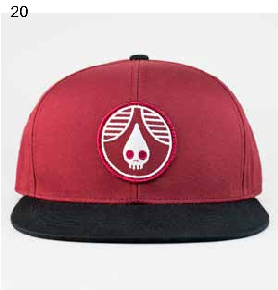
Twill High Crown + Flat Brim

Full fabric panels. Popular fabrics & fits: