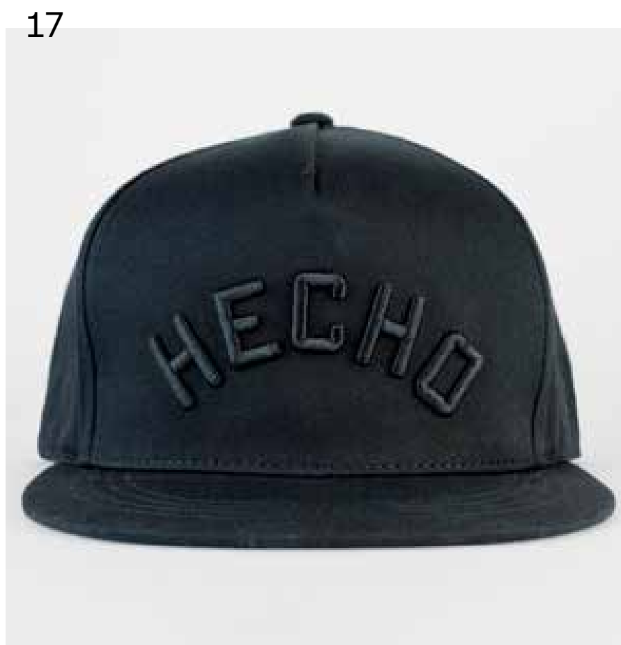
Twill High Crown + Flat Brim

Full fabric panels. Popular fabrics & fits: