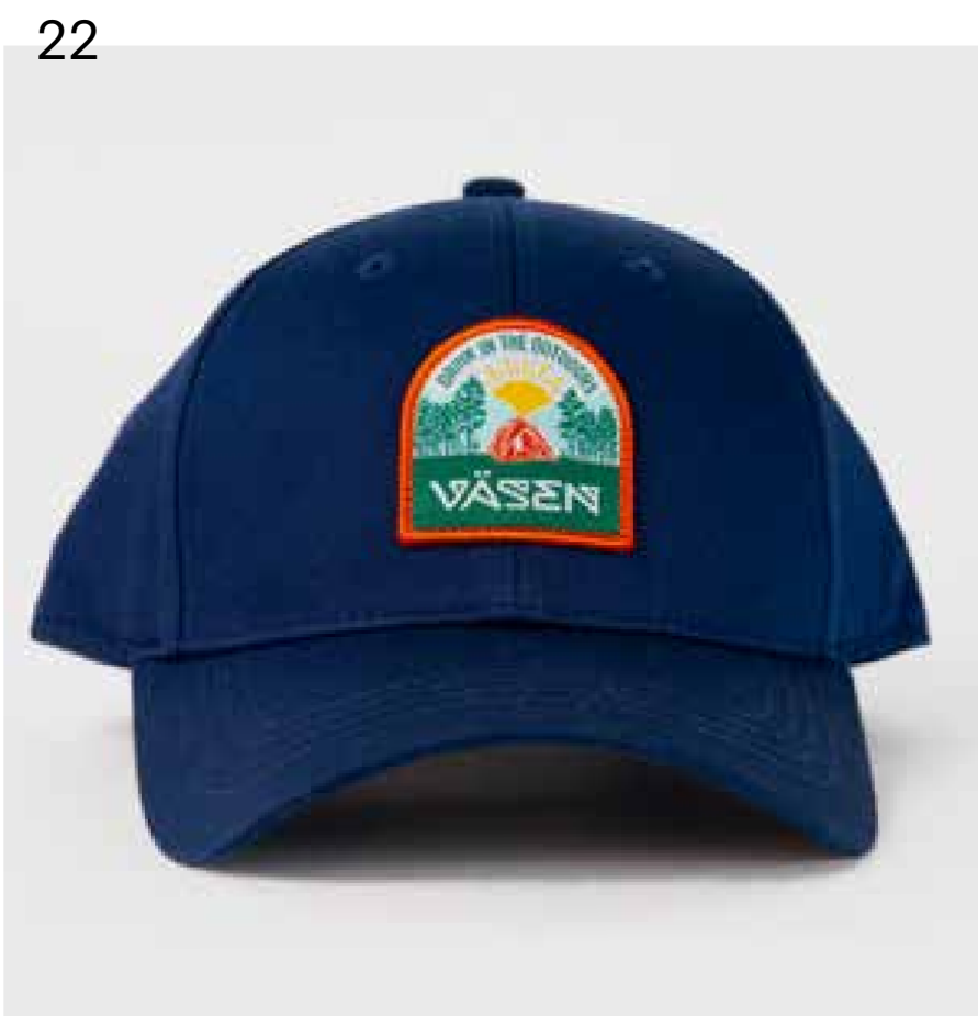
Twill Low Crown + Curved Brim