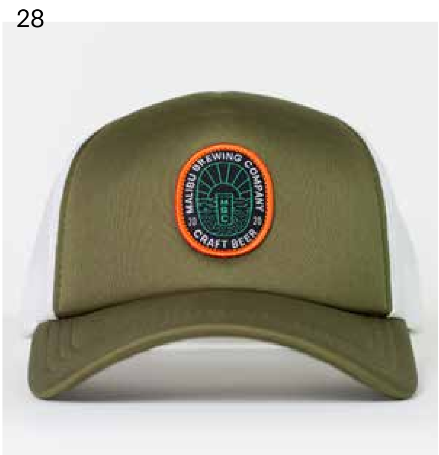
Foam + Mesh Mid Crown + Curved Brim