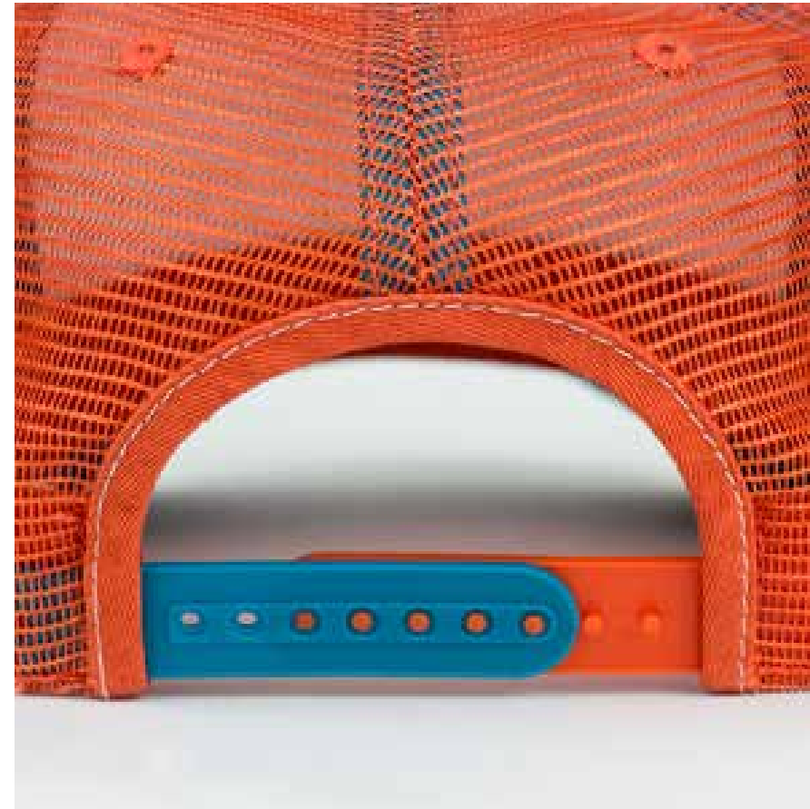
2 Color Snapback