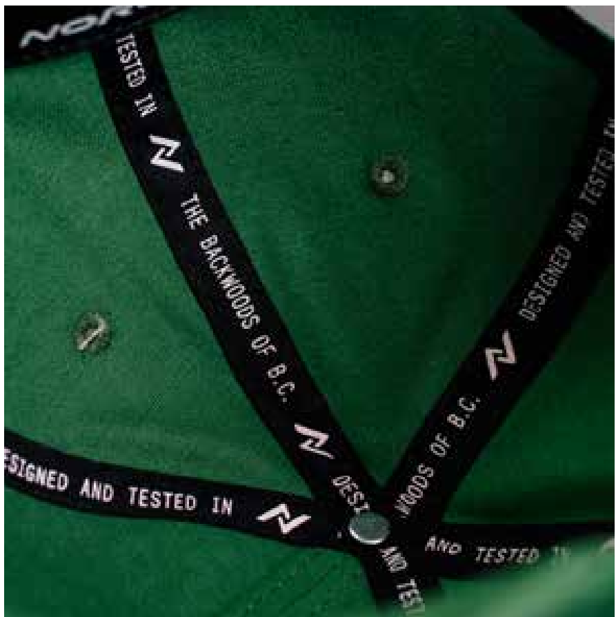
Printed Interior Taping