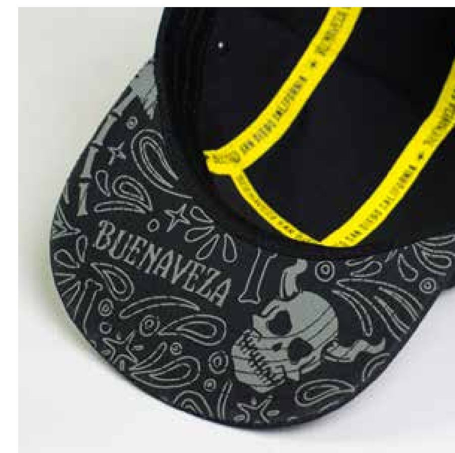
Underbrim Screen Print