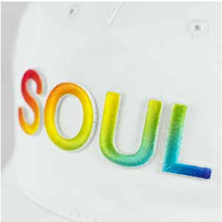
Sublimated 3D Puff Embroidery