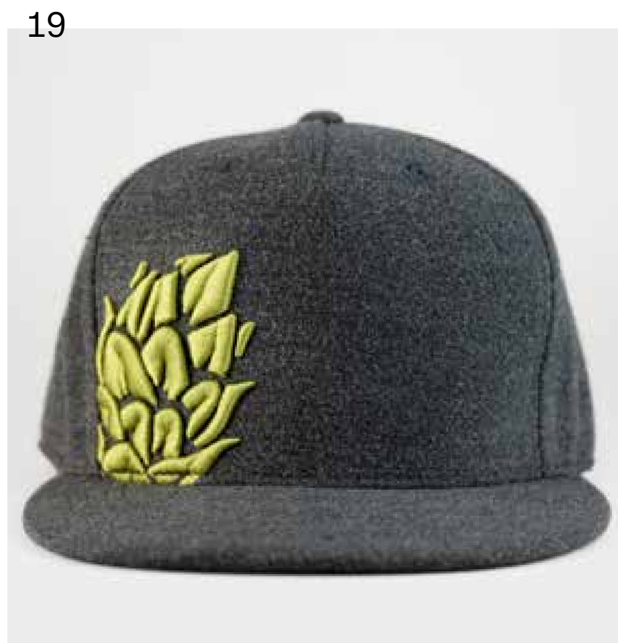
Wool Blend High Crown + Flat Brim