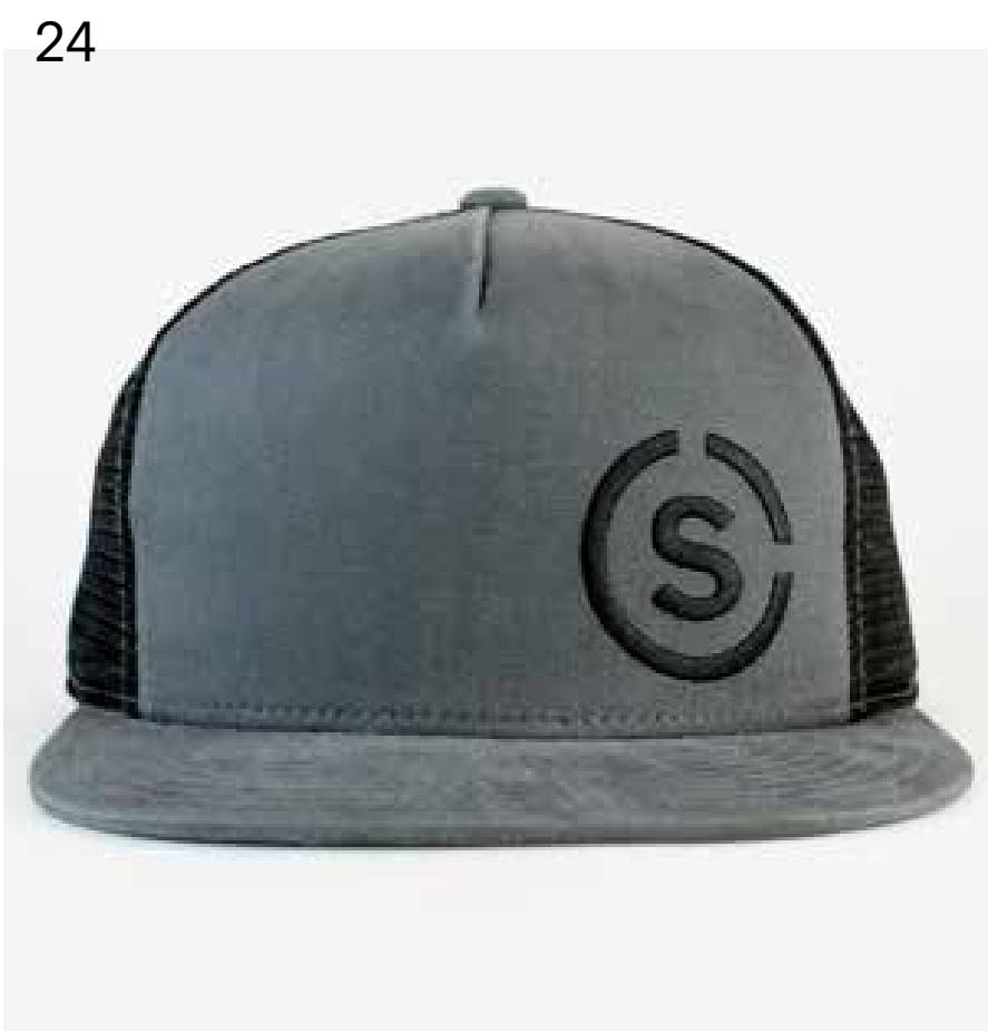
Twill + Mesh High Crown + Flat Brim

Fabric crown and mesh back. Popular fabrics & fits: