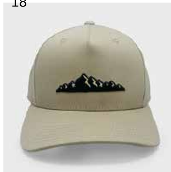
Twill Low Crown + Curved Brim