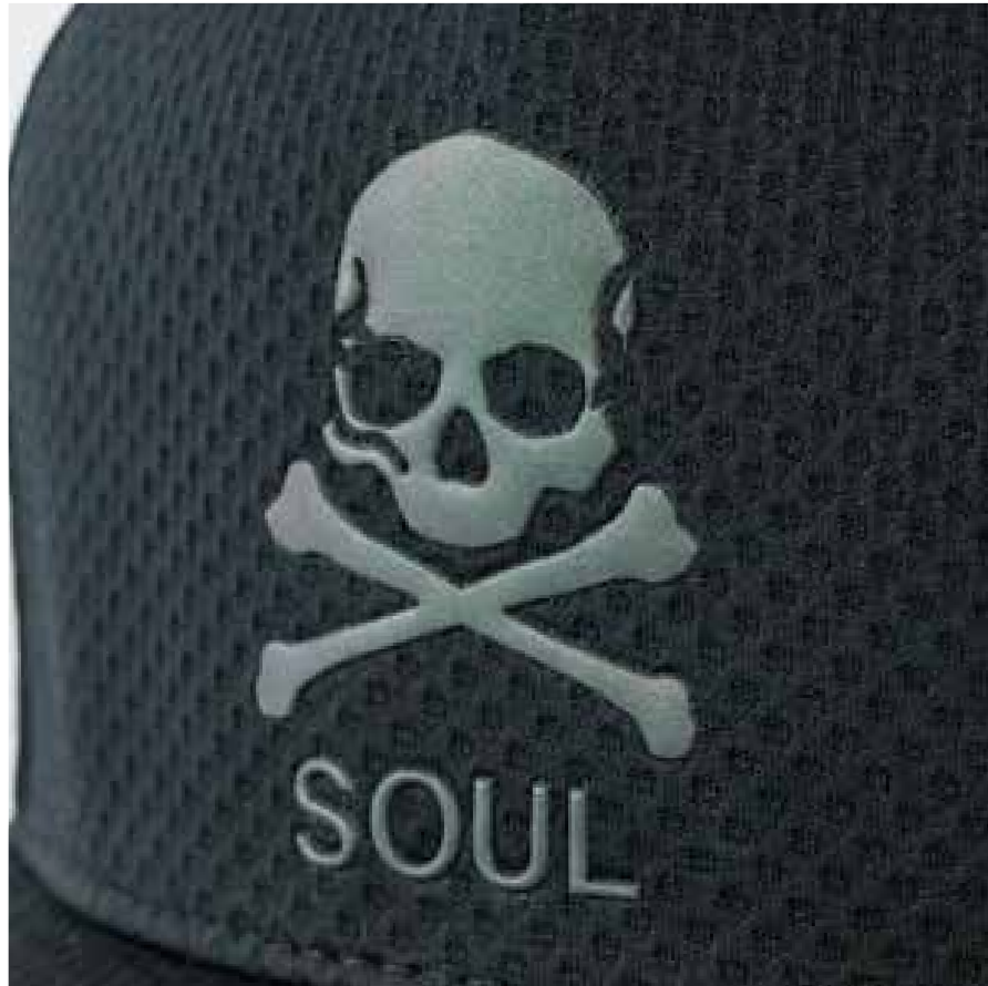
Iridescent Rubber Applique