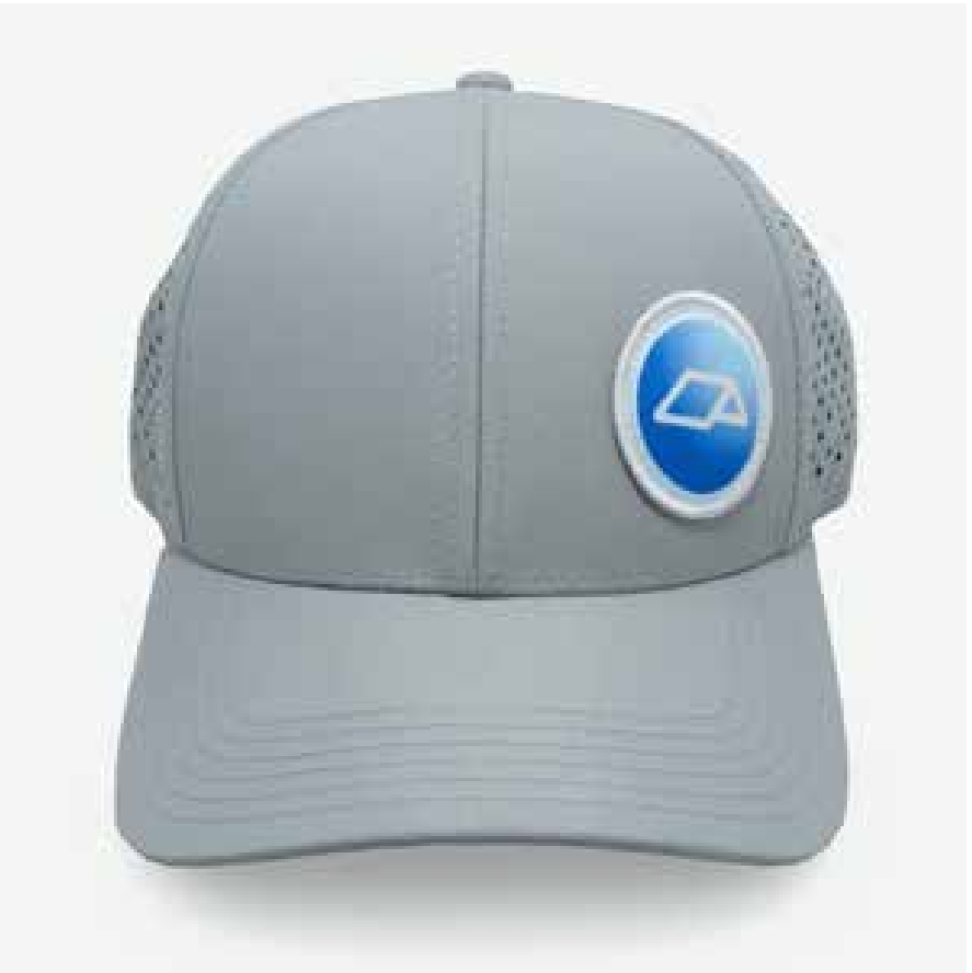
Performance Polyester Twill Blend