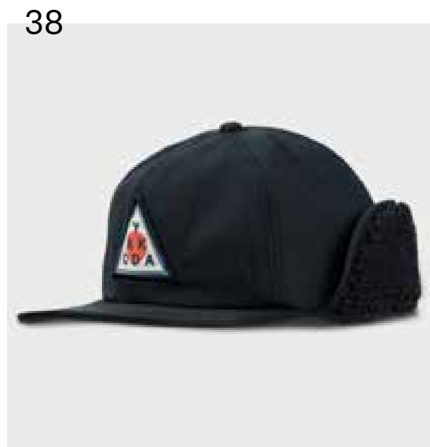
Ripstop + Fleece