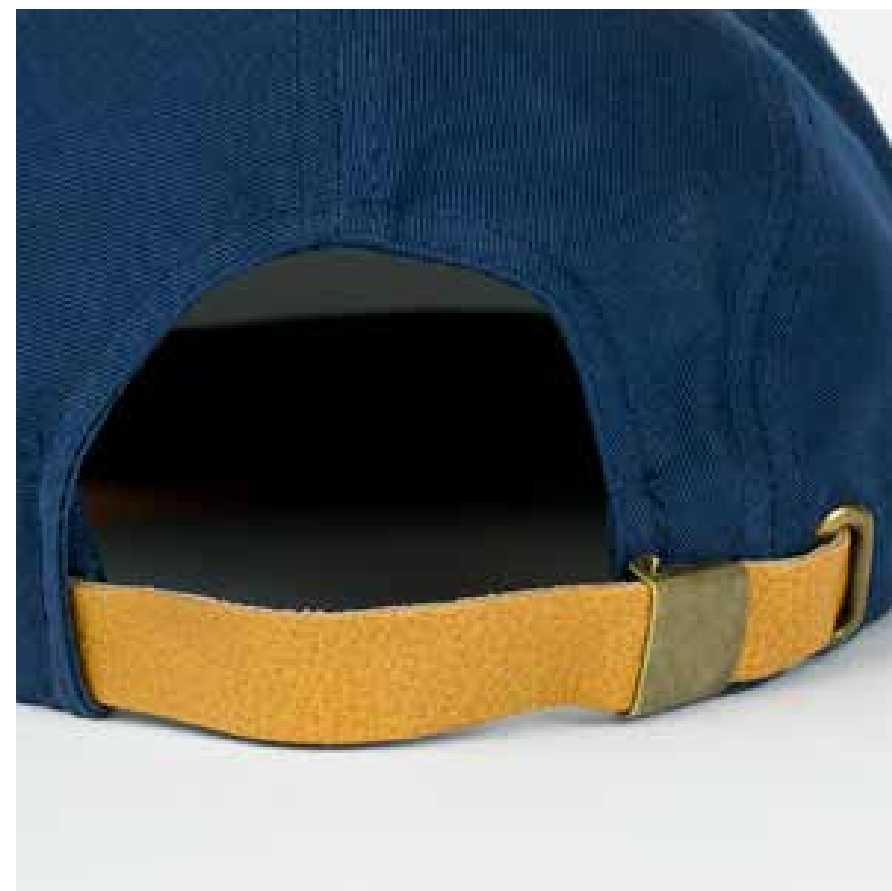
Metal Clasp - Leather Strap