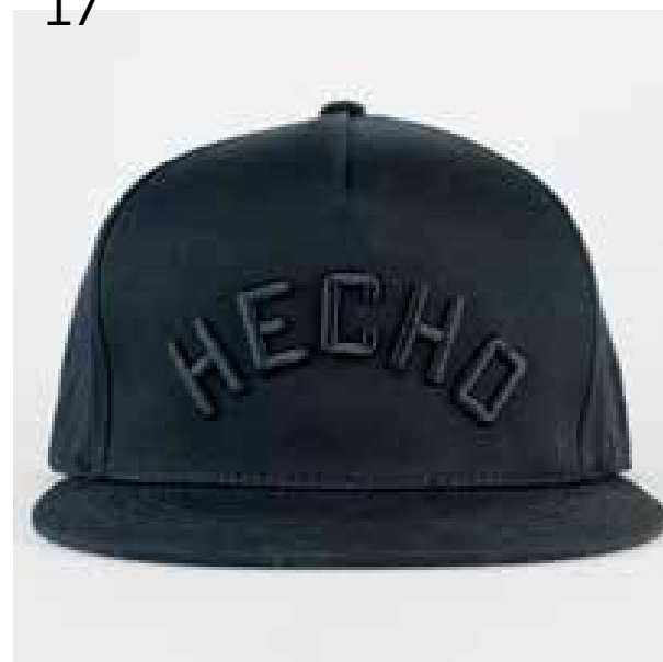
Twill High Crown + Flat Brim