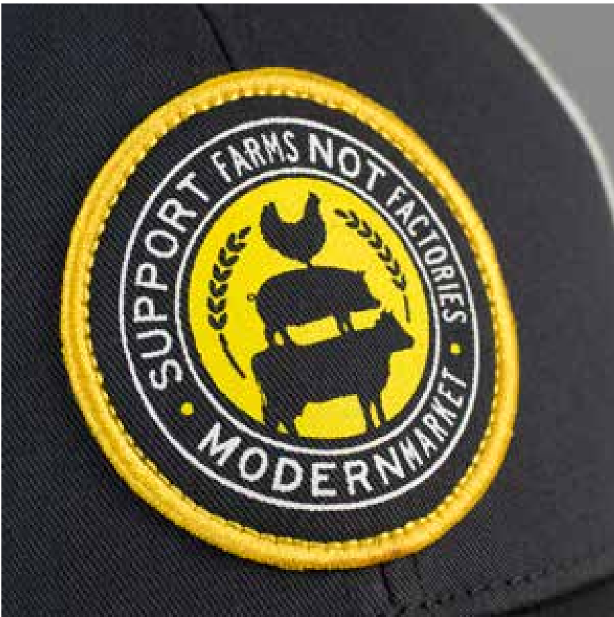
Screen Printed Patch w/ Merrowed Edge