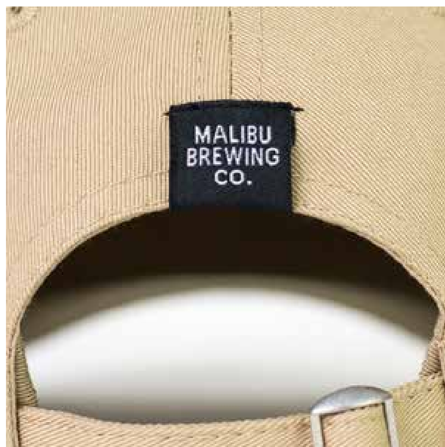
Woven Clamp Tag