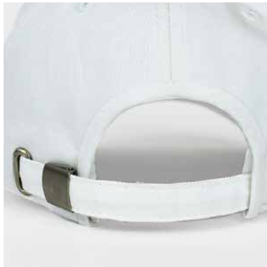
Metal Clasp - Cloth Strap