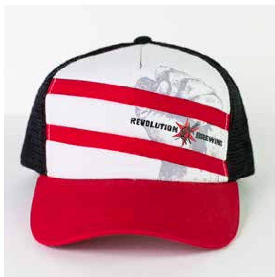
Sewn on Stripes - Crown