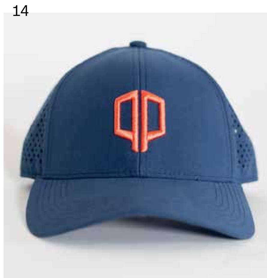
Polyester + Perforated Poly Mid Crown + Curved Brim

Performance material. Popular fabrics & fits: