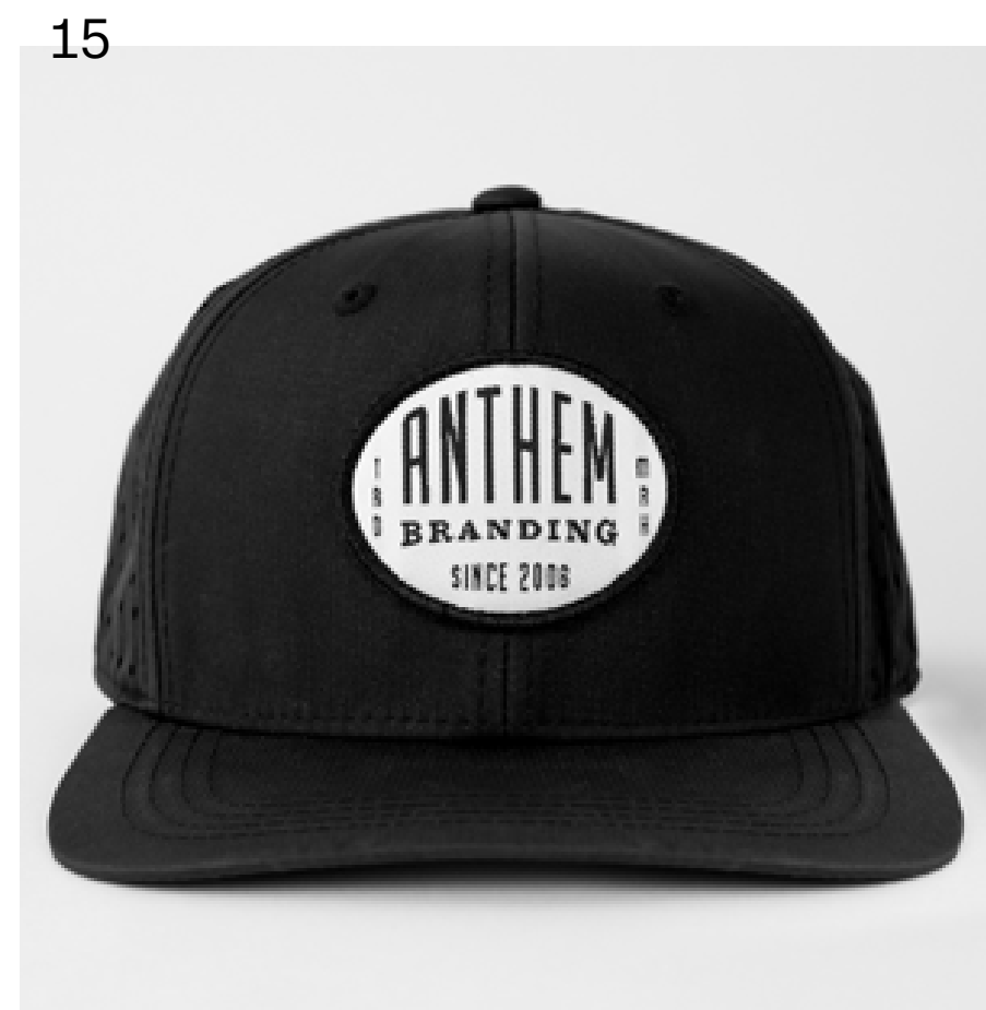
Polyester + Perforated Poly High Crown + Flat Brim