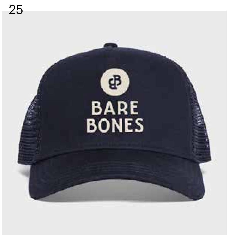
Structured Twill + Mesh Mid Crown + Curved Brim