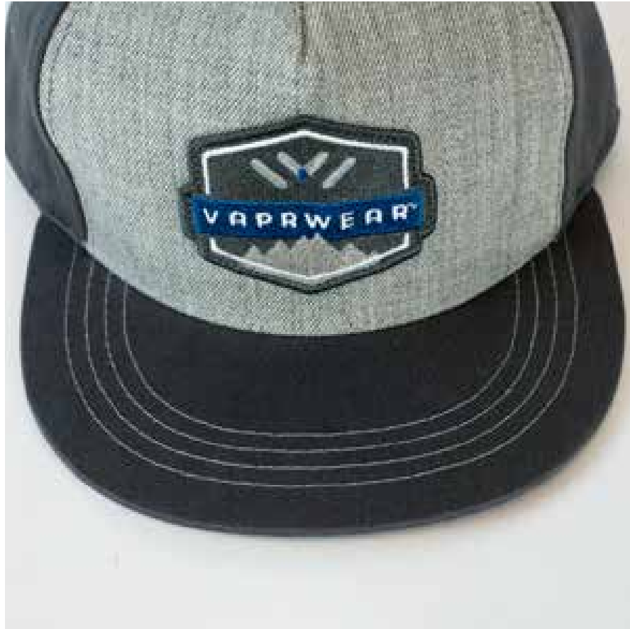
Flat Brim - Rounded Silhouette