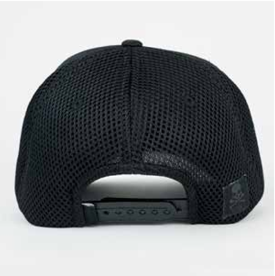
Performance Polyester Spacer Mesh