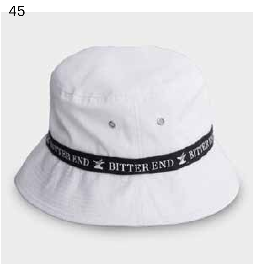
Twill with strap