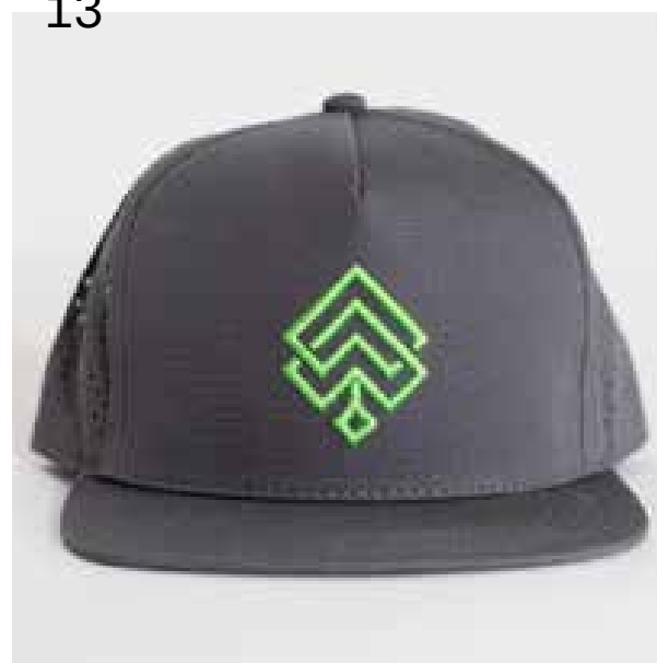
Polyester + Perforated Poly High Crown + Flat Brim