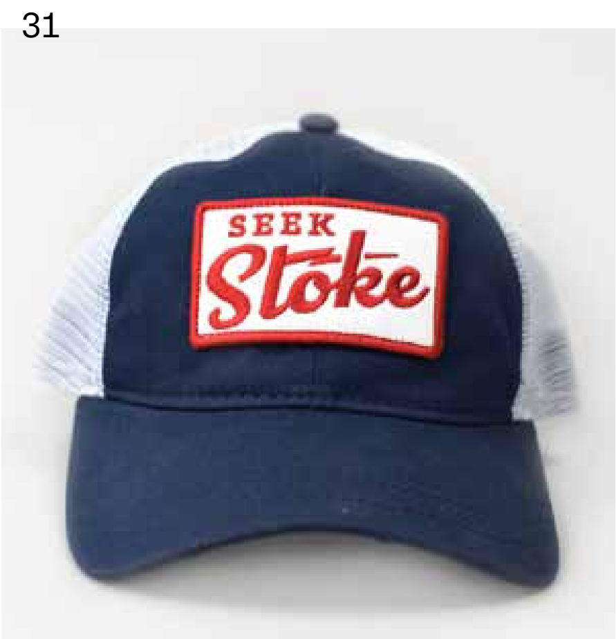
Unstructured Twill + Mesh Low Crown + Curved Brim

Unstructured panels and curved brim. Popular fabrics: