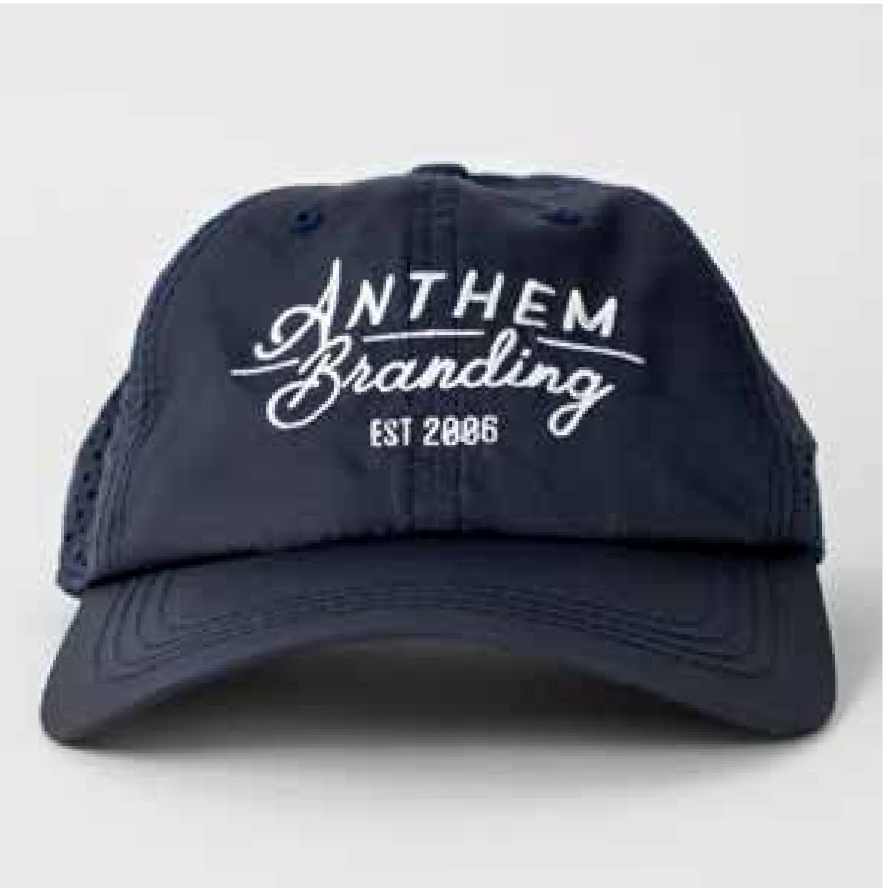
Performance Polyester Fabric