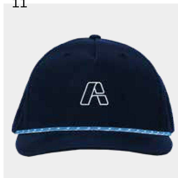
Polyester + Perforated Poly Low Crown + Curved Brim