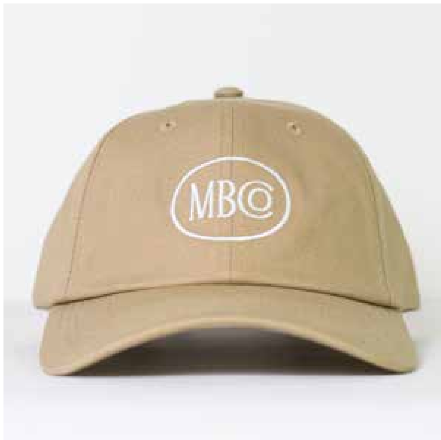
Low Crown Height