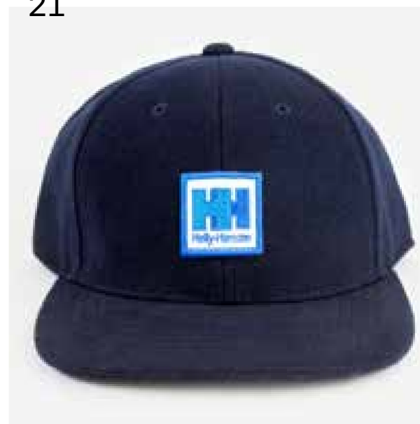
Wool Blend High Crown + Flat Brim