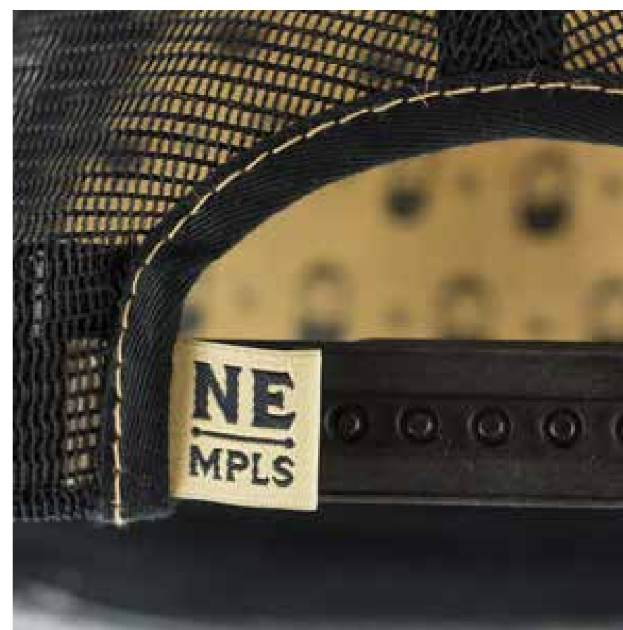
Snapback Woven Clamp Tag