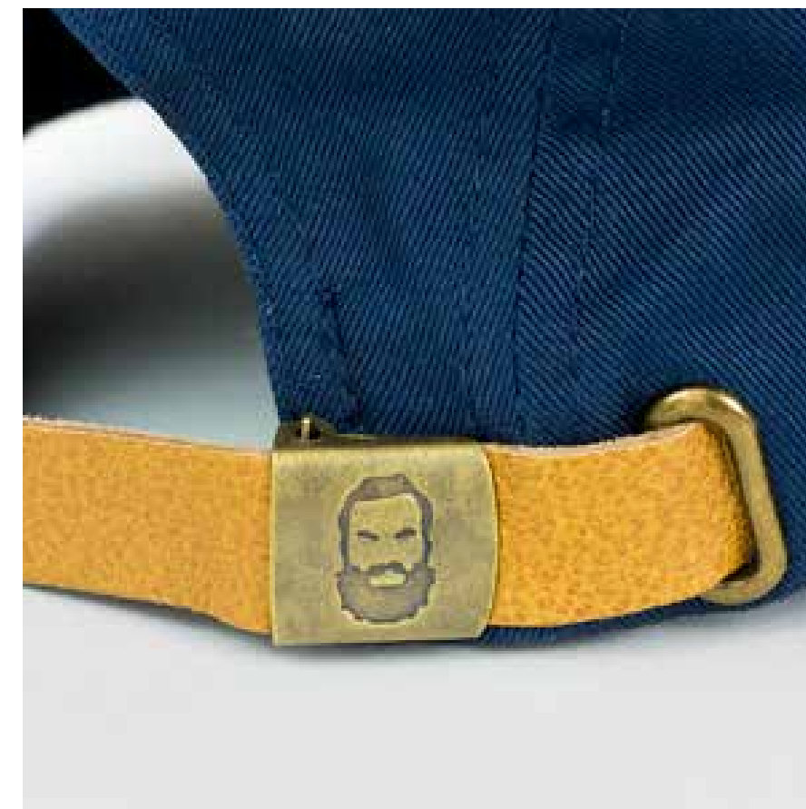
Engraved Metal Closure