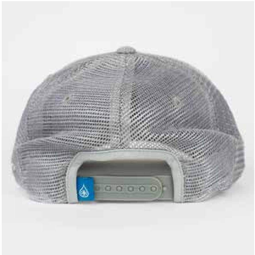
Washed Unstructured Mesh