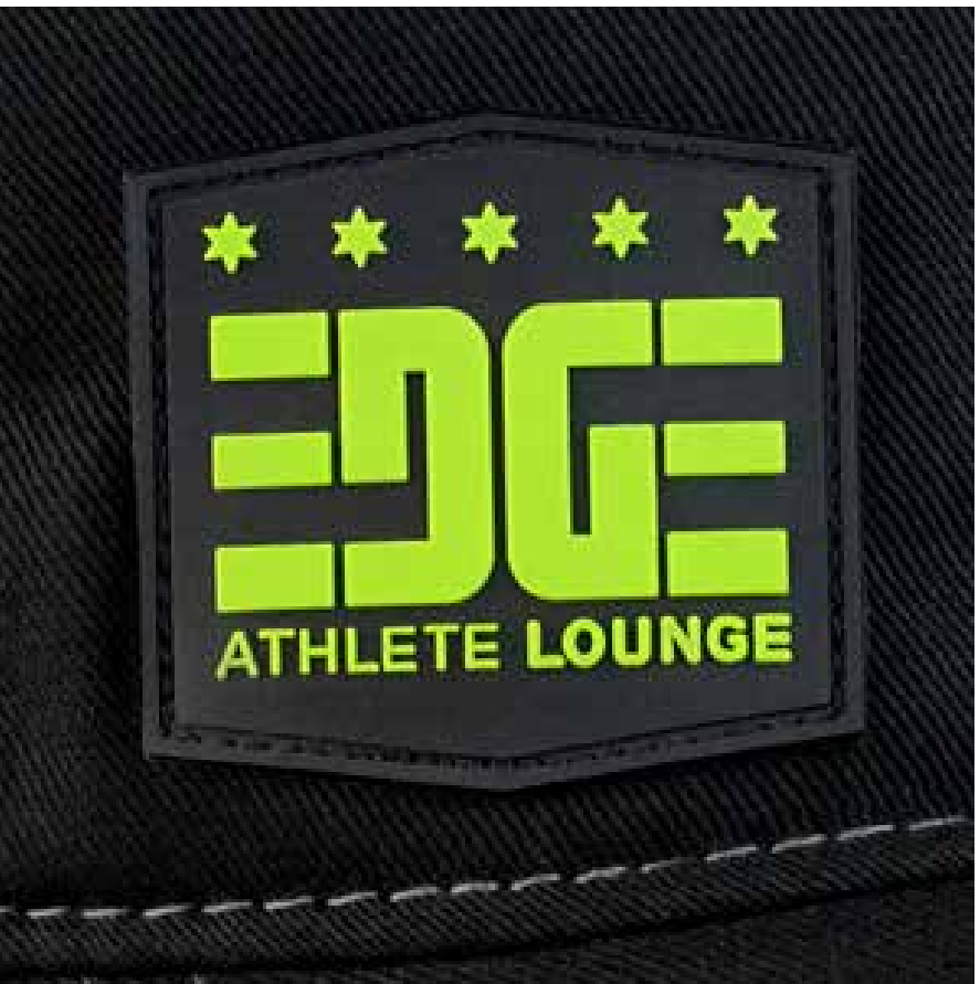
Embossed Rubber Patch