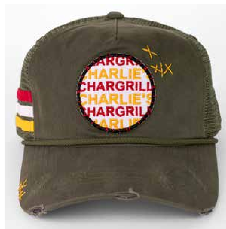
Distressing on Brim // Accent Embroidery