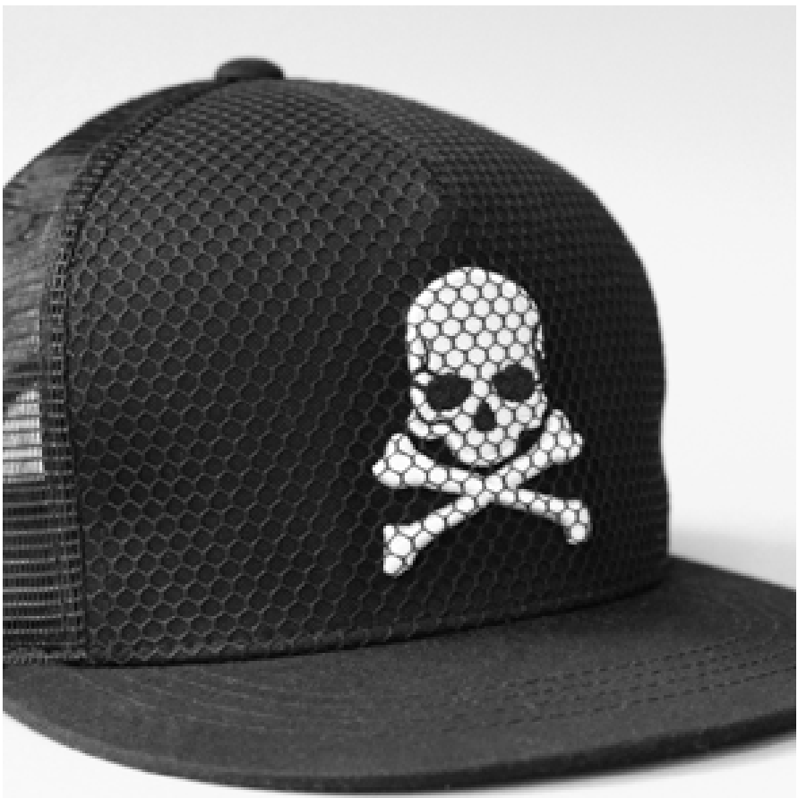
Mesh Crown Overlay