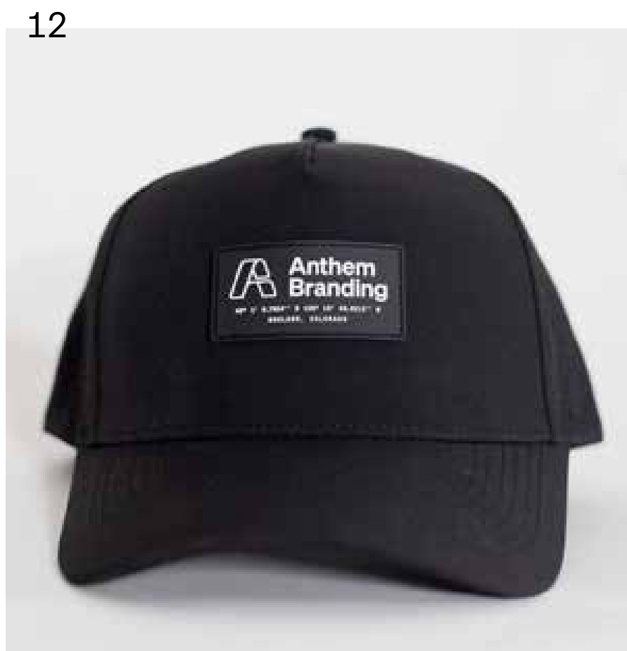
Polyester + Perforated Poly Mid Crown + Curved Brim