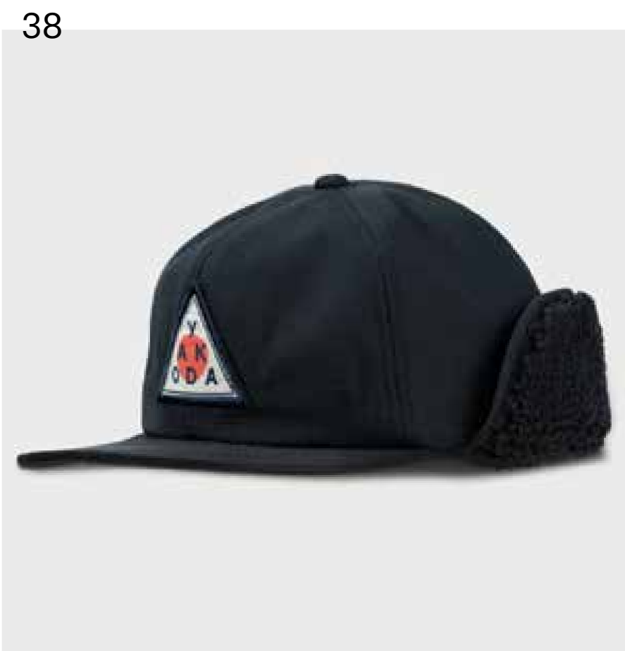
Ripstop + Fleece Interior Available in an array of fabrics/fits

Full fabric, ear flaps and fleece interior.