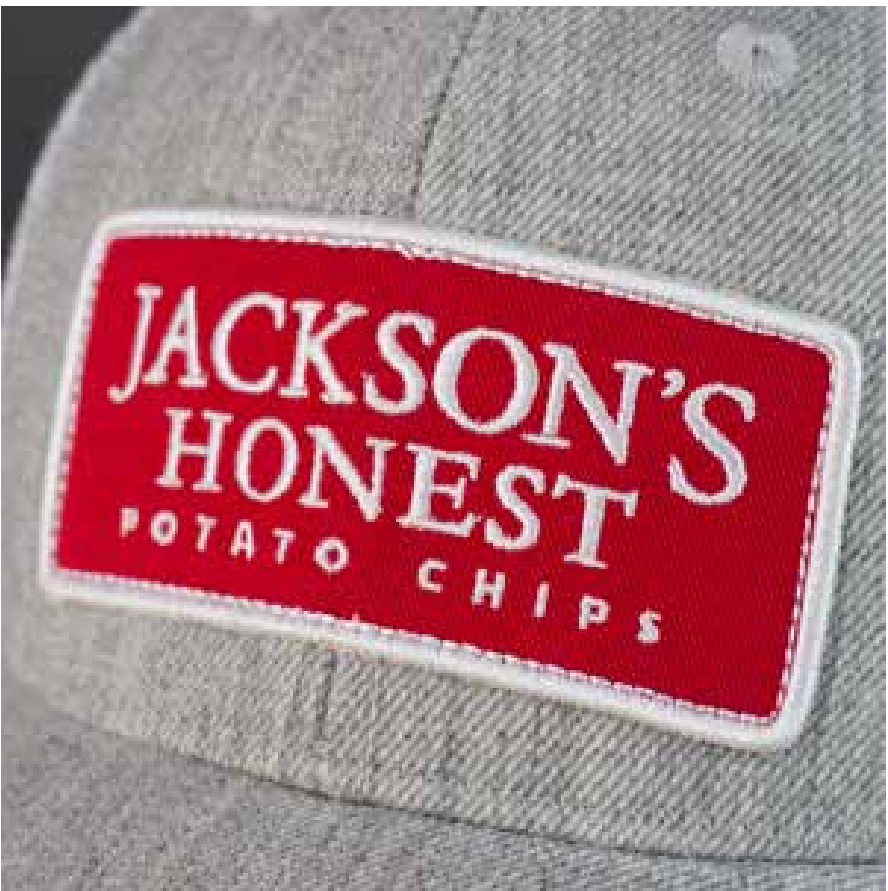
Embroidered Twill Patch w/ Merrowed Edge