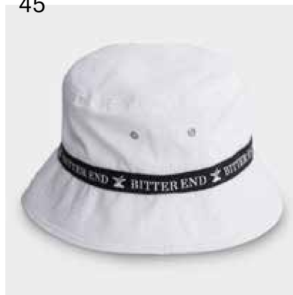
Twill with strap