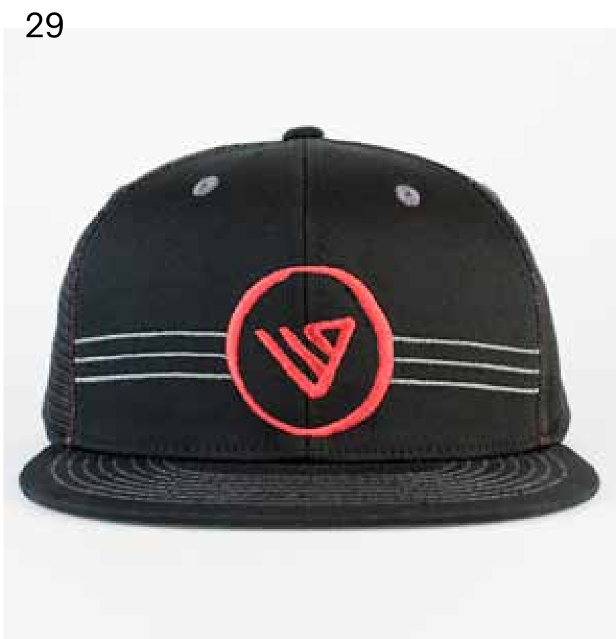
Twill + Mesh High Crown + Flat Brim

Fabric crown and mesh back. Popular fabrics & fits: