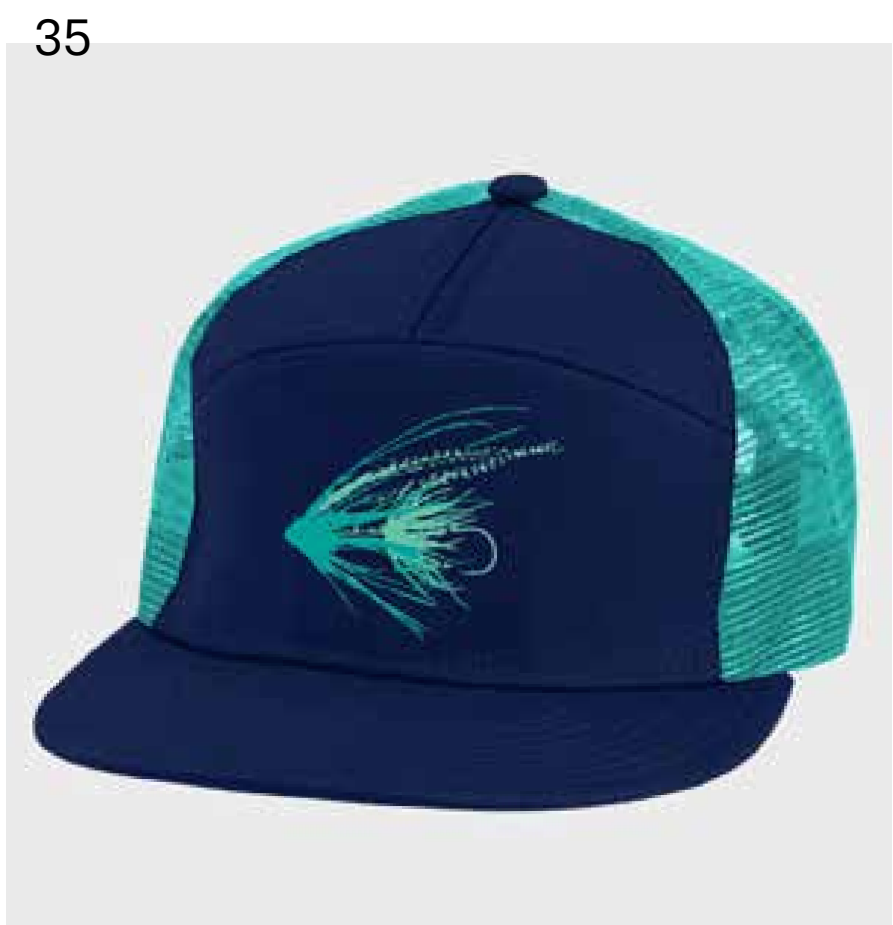
Twill + Mesh

Open structure and curved brim. Popular fabrics & fits: