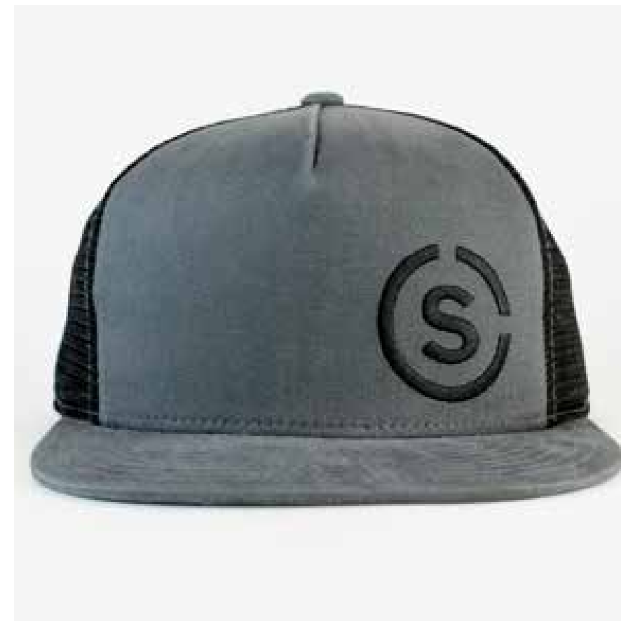
High Crown Height