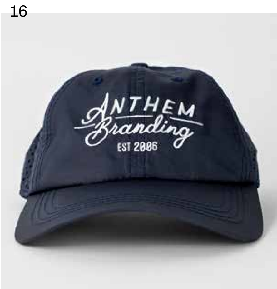
Unstructured Polyester + Perforated Poly Low Crown + Curved Brim

Full fabric panels. Popular fabrics & fits: