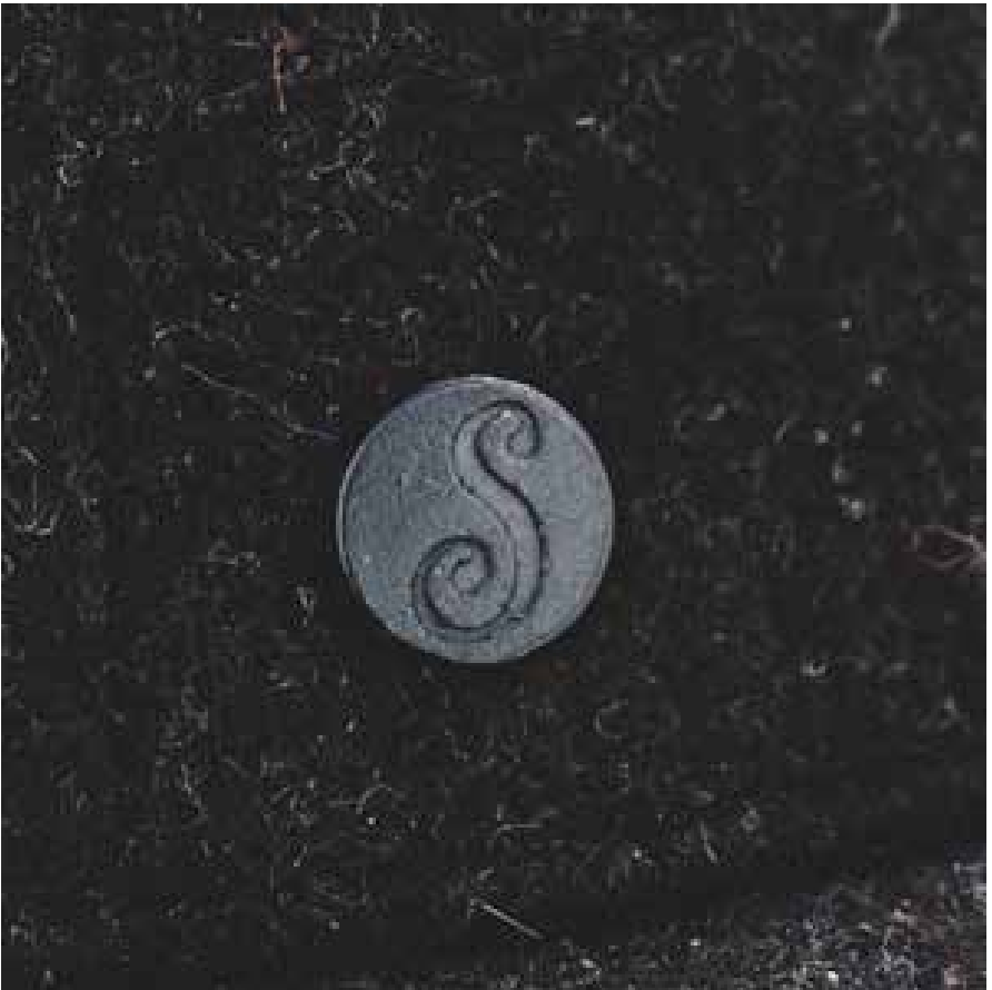
Debossed Metal Rivet