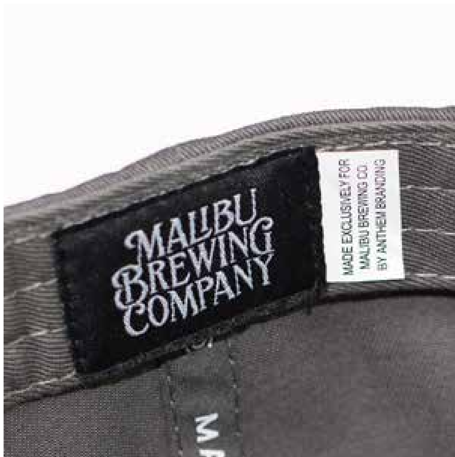
Interior Woven Label