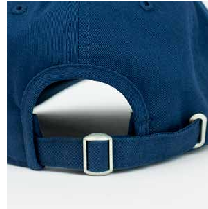
Slide Metal Back