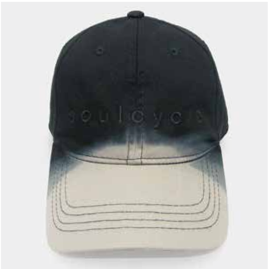
Acid Wash Twill Fabric