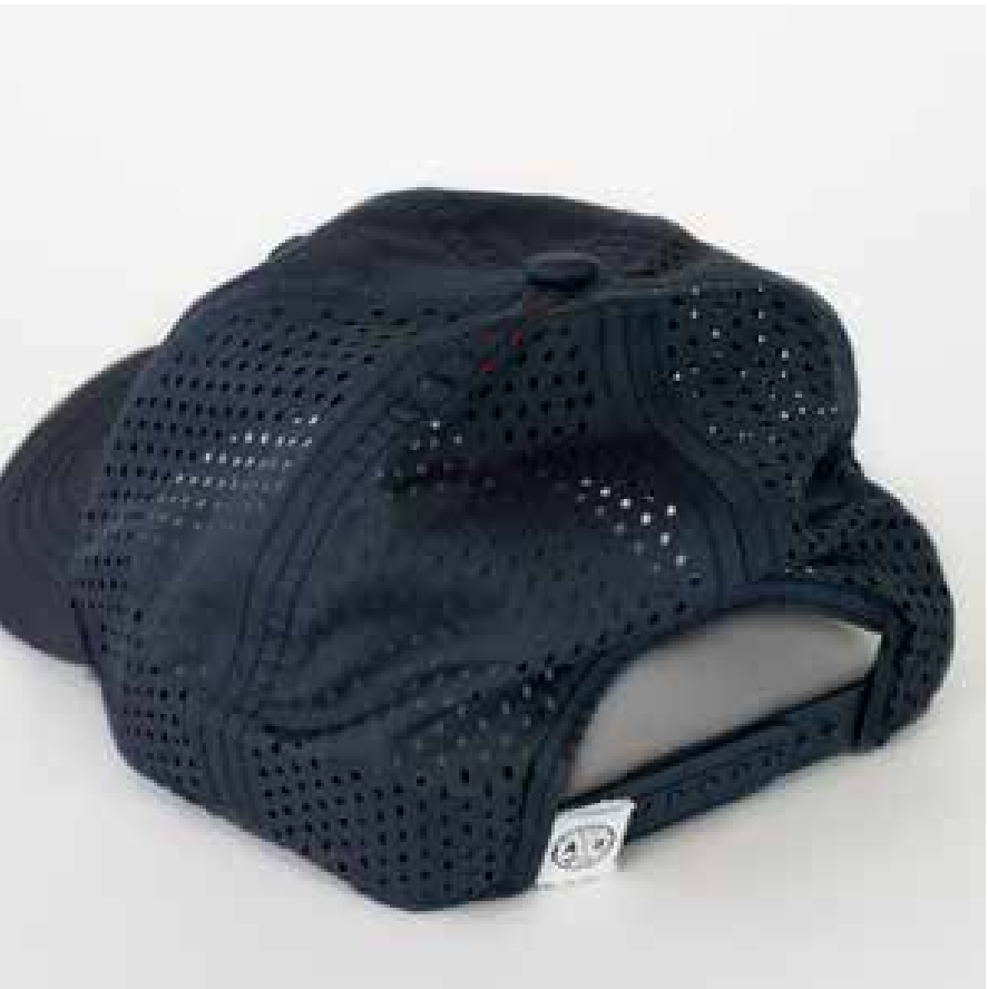
Performance Perforated Polyester