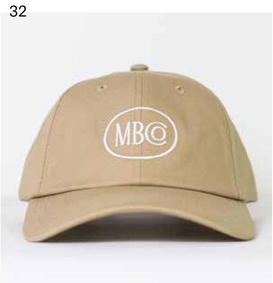
Washed Twill Low Crown + Curved Brim

Unstructured panels and curved brim. Popular fabrics: