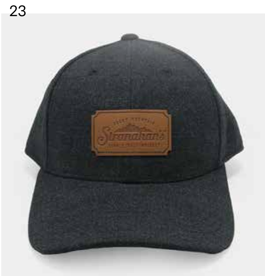
Wool Blend Low Crown + Curved Brim

Fabric crown and mesh back. Popular fabrics & fits: