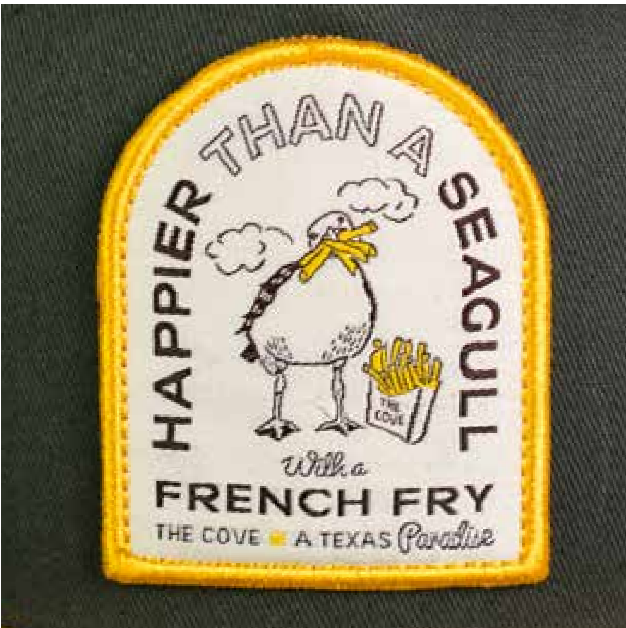
Woven Patch w/ Merrowed Edge