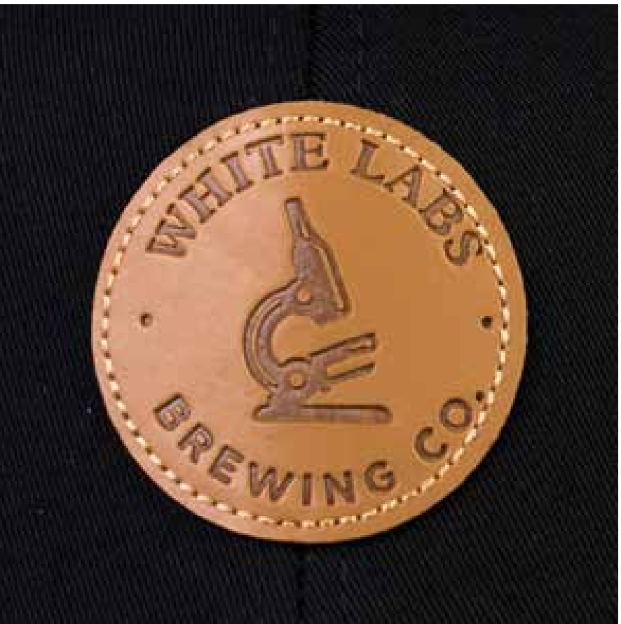
Debossed Genuine Leather Patch