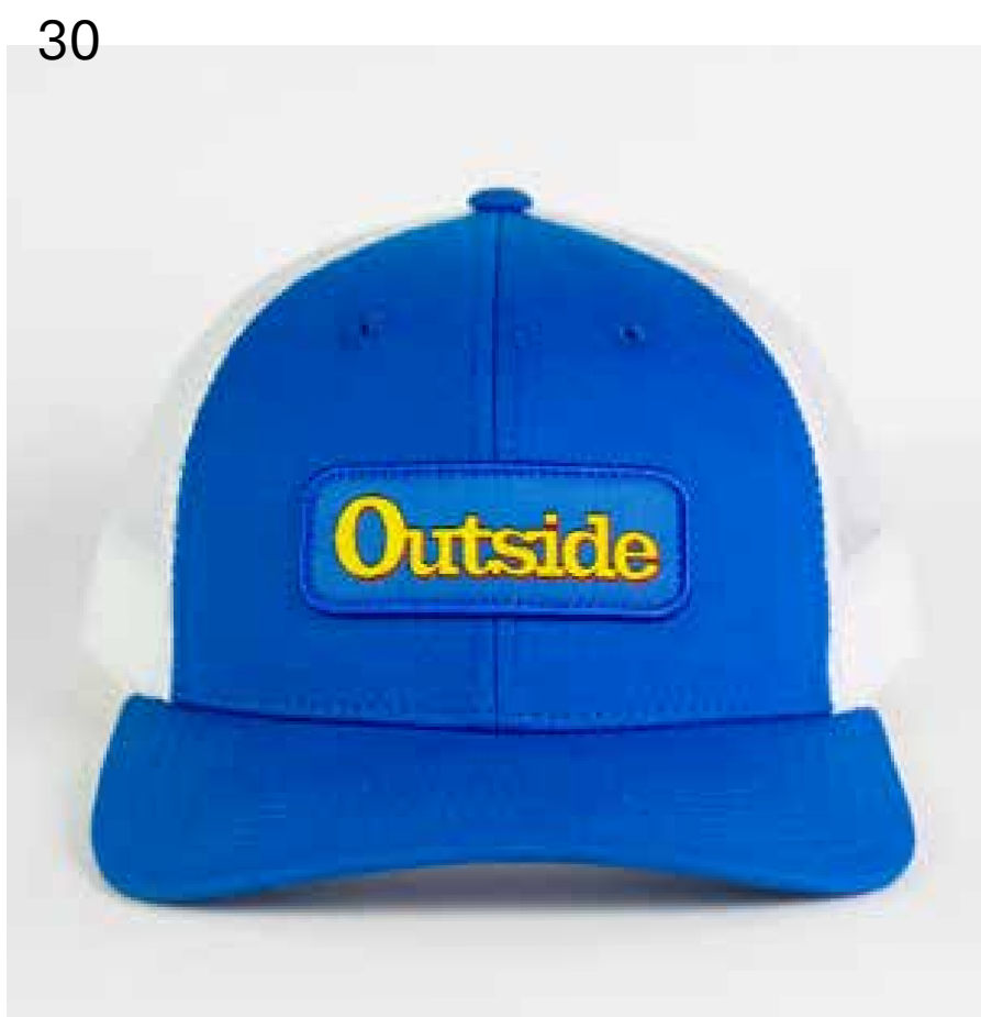
Structured Twill + Mesh Low Crown + Curved Brim