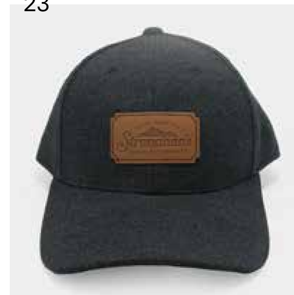
Wool Blend Low Crown + Curved Brim