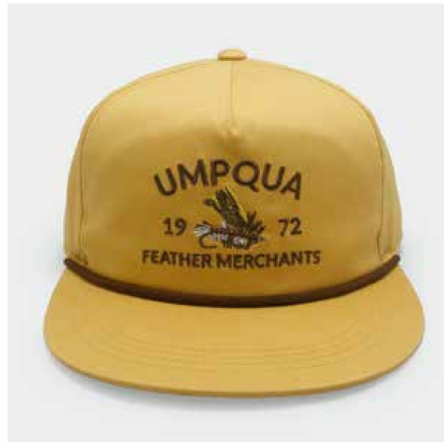
Mid Crown Height