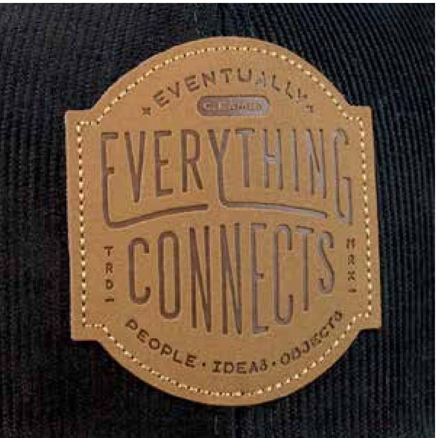
Laser Etched Faux Leather Patch