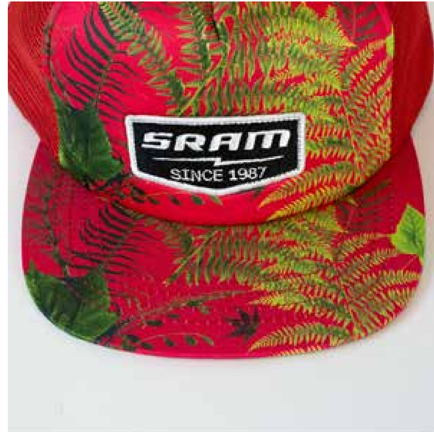
Flat Brim - Square Silhouette