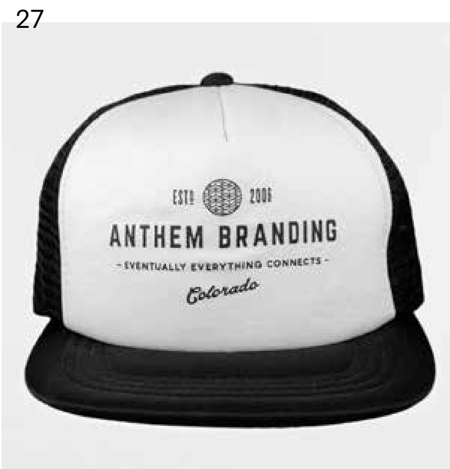
Foam + Mesh High Crown + Flat Brim