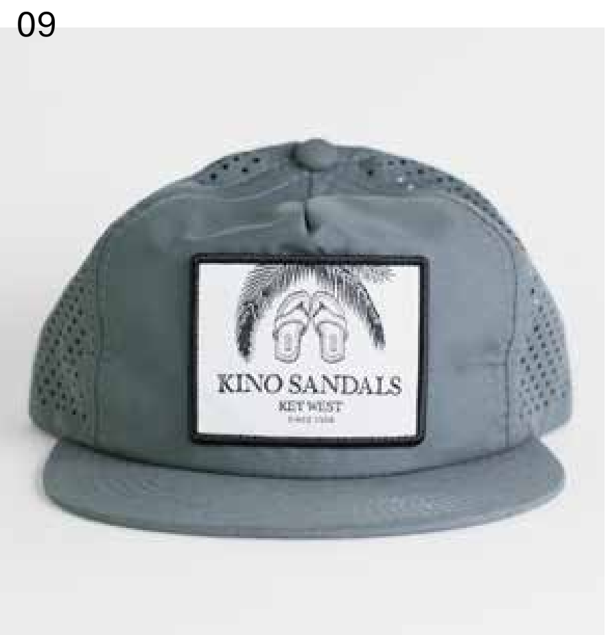
Nylon / Perforated Mesh