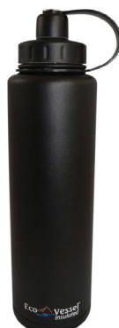
ECO VESSEL BIG FOOT 45 OZ