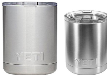
YETI RAMBLER 10 OZ