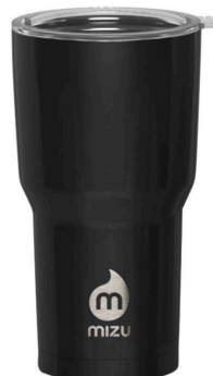
MIZU T20 20 OZ