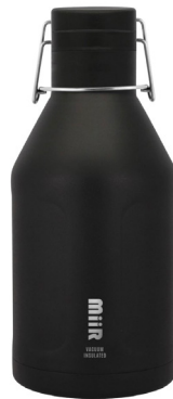
MIIR GROWLER 64 OZ