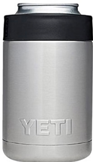
YETI COLSTER 10 OZ