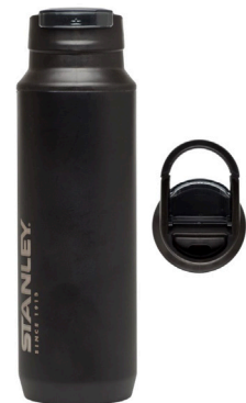
STANLEY MOUNTAIN SWITCHBACK MUG 16 OZ