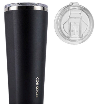
CORKCICLE WATERMAN TUMBLER 24 OZ