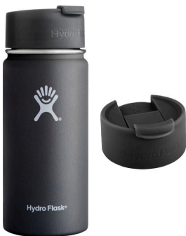
HYDRO FLASK COFFEE 12, 16, 20 OZ