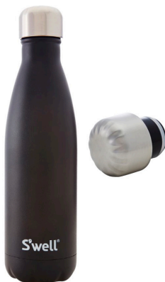
SWELL 9, 17, 25 OZ