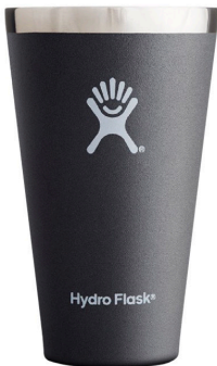
HYDRO FLASK TRUE PINT 16 OZ