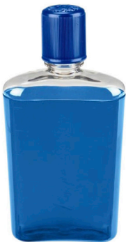
NALGENE FLASK 12 OZ