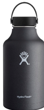
HYDRO FLASK WIDE MOUTH 64 OZ