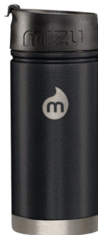
MIZU V5 COFFEE LID 17 & 24 OZ