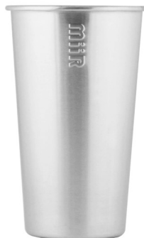
MIIR PINT CUP 16 OZ