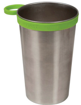
FIFTY FIFTY 20 OZ