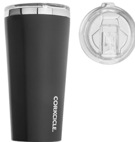
CORKCICLE TUMBLER 16 OZ