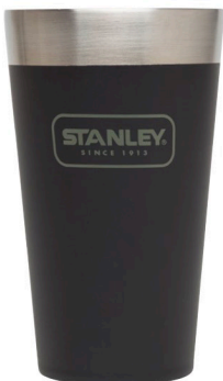
STANLEY ADVENTURE STACKING VACUUM PINT 16 OZ