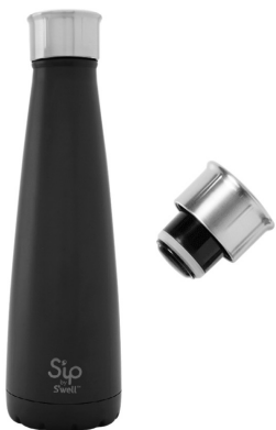
SIP BY SWELL 15 OZ