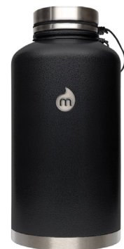
MIZU V20 68 OZ