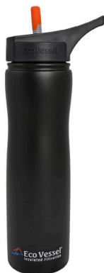
ECO VESSEL SUMMIT 24 OZ