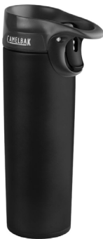
CAMELBACK FORGE 16 OZ