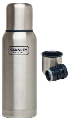
STANLEY ADVENTURE VACUUM BOTTLE 25 OZ