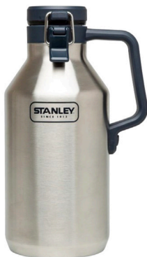
STANLEY ADVENTURE GROWLER 64 OZ