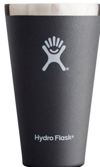
HYDRO FLASK TRUE PINT 16 OZ