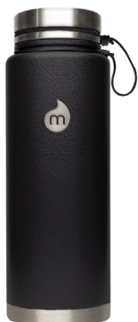
MIZU V12 40 OZ