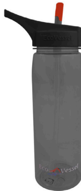
ECO VESSEL SURF RECYCLED BOTTLE 22 OZ