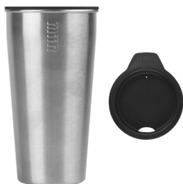
MIIR DAILY TUMBLER 12 OZ