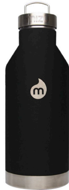
MIZU V6 20 OZ