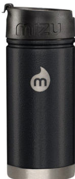
MIZU V5 COFFEE LID 17 & 24 OZ