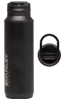
STANLEY MOUNTAIN SWITCHBACK MUG 16 OZ