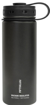
FIFTY FIFTY 18 OZ