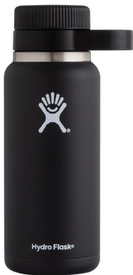
HYDRO FLASK GROWLER 32 OZ