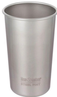
KLEAN KANTEEN 16 OZ