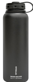
FIFTY FIFTY 40 OZ