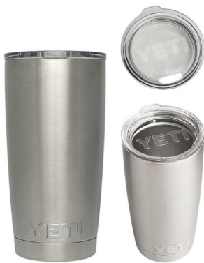
YETI RAMBLER 20 OZ