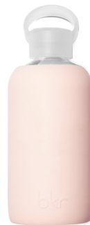
BKR TUTU 500 ML