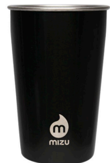
MIZU PARTY CUP SET (2) 16 OZ