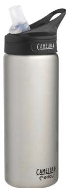
CAMELBACK EDDY 20 OZ