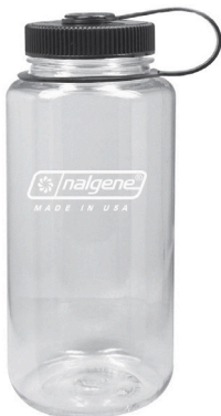
NALGENE WIDE MOUTH 32 OZ