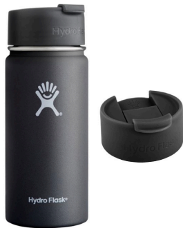
HYDRO FLASK COFFEE 12, 16, 20 OZ