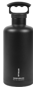
FIFTY FIFTY GROWLER - TANK STYLE 64 OZ