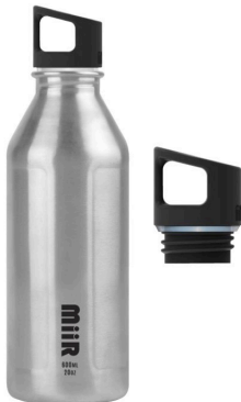
MIIR CLASSIC 20 OZ