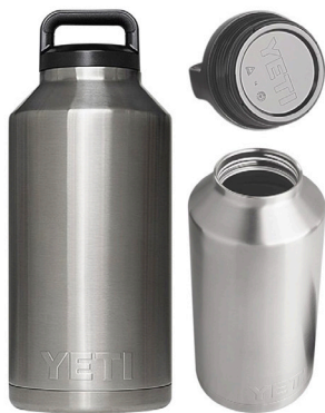
YETI RAMBLER 64 OZ