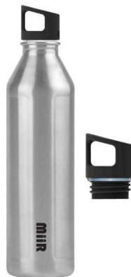
MIIR CLASSIC 20, 27 OZ